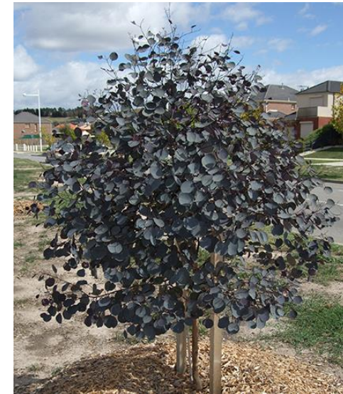
Eucalyptus cladocalyx Vintage Red