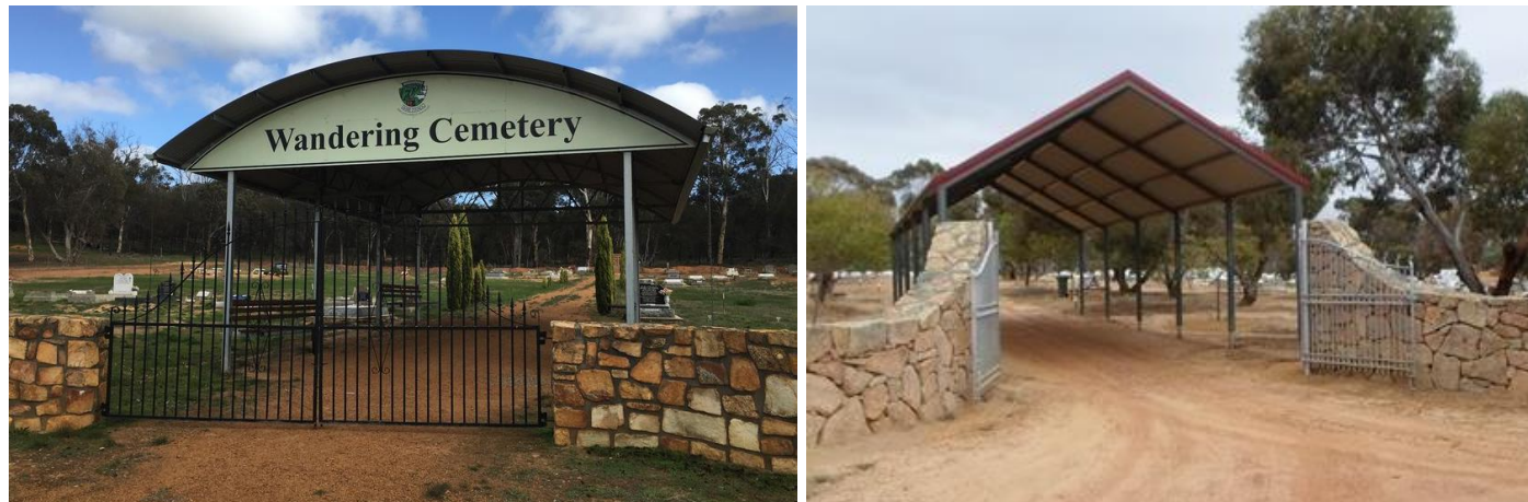
Item 3(e) - Wrought iron entry and a drive through gazebo / shelter