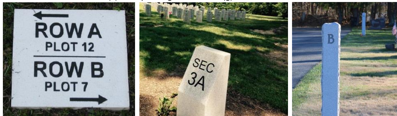
Item 1(c) – Wayfinding markers & 2(g) – Bollards on Corners