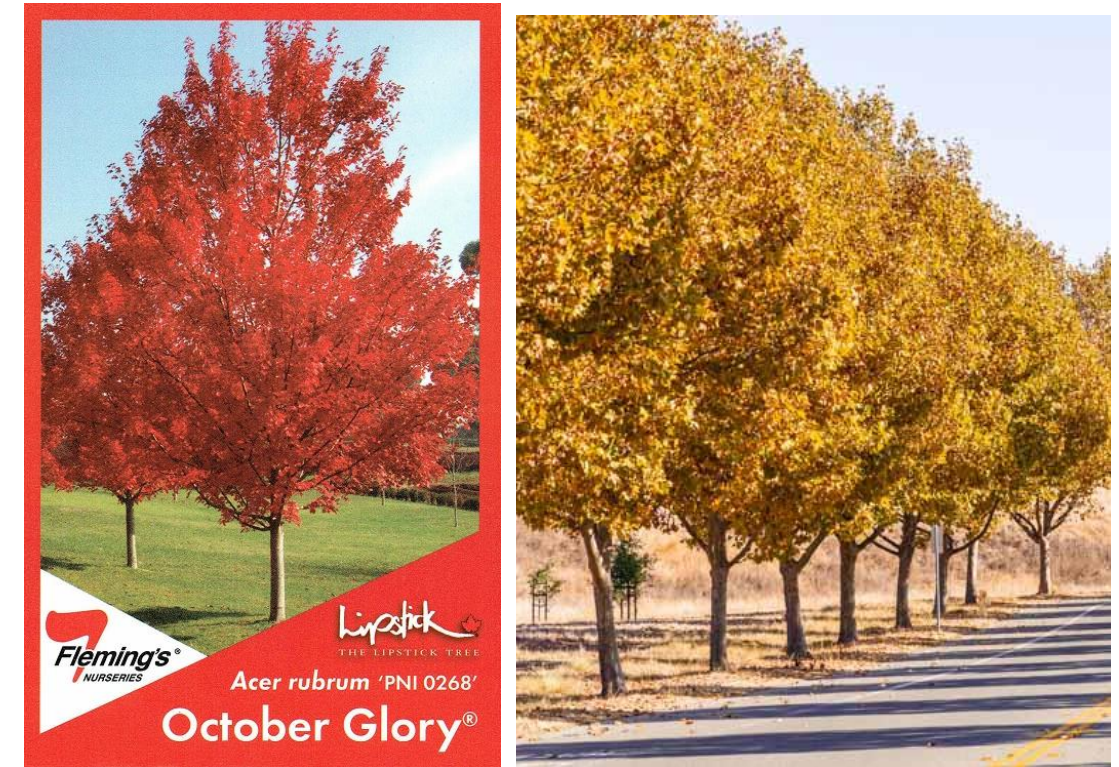
POSSIBLY Item 4(c) – Trees & disabled/elderly parking in centre of main access road? (This requires a survey to be completed to see the available space for the centre roadway. Detailed designs and alternative options will be completed and included in the first revision of this plan.)