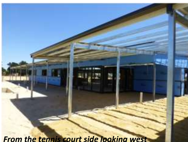
From the tennis court side looking west