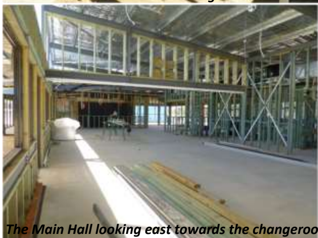
The Main Hall looking east towards the changerooms