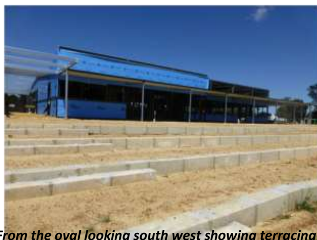
From the oval looking south west showing terracing