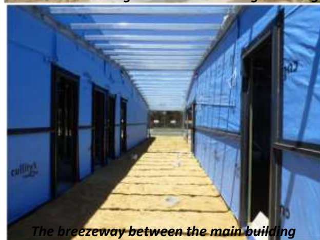
The breezeway between the main building and changerooms - to the tennis courts