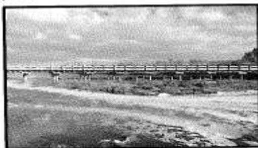
Gordon River Bridge, 2014

Information as taken from The Stories of Tambellup , Corner Shop Museum.